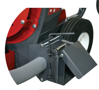
Foot Activated Wand Control (optional)